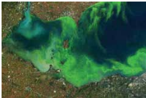
TOP: LAURENTIAN GREAT LAKES AS SEEN FROM SPACE BOTTOM: LAKE STURGEON FRESHWATER RESTORATION ECOLOGY; ZEBRA MUSSELS; FISH FRY; ALGAL BLOOM IN LAKE ERIE