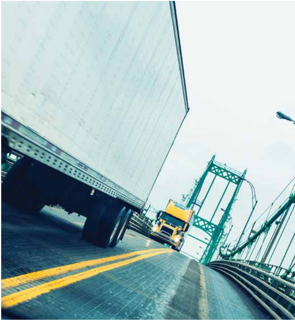
TOP: AMBASSADOR BRIDGE BOTTOM: CANADA BORDER SERVICES AGENCY AMBASSADOR BRIDGE CUSTOMS, US CUSTOMS AND BORDER PROTECTION PORT OF DETROIT, CANADA BORDER SERVICES AGENCY OFFICER, DETROIT-WINDSOR TUNNEL