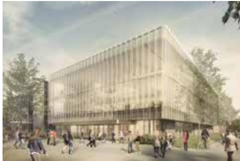
TOP: WINDSOR HALL BOTTOM: SCHOOL OF CREATIVE ARTS, ED LUMLEY CENTRE FOR ENGINEERING INNOVATION, JOYCE ENTREPRENEURSHIP CENTRE, SCIENCE RESEARCH AND INNOVATION CENTRE